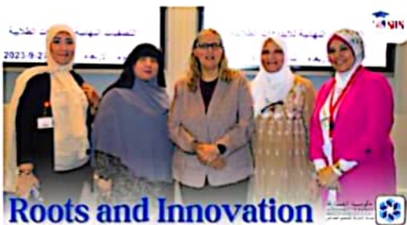
Roots and Innovation