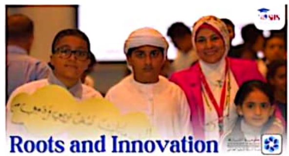
Roots and Innovation