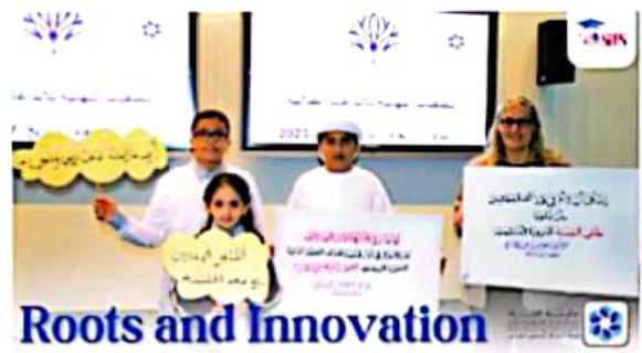
Roots and Innovation