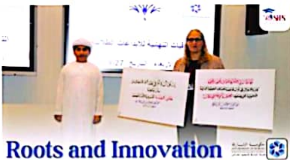
Roots and Innovation